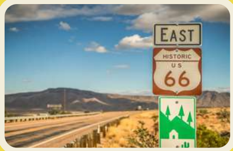
USA Route 66